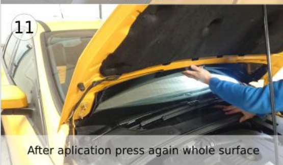
11 After application press again whole surface