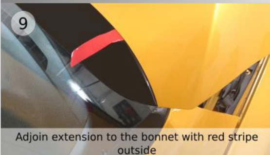
9 Adjoin extension to the bonnet with red stripe outside