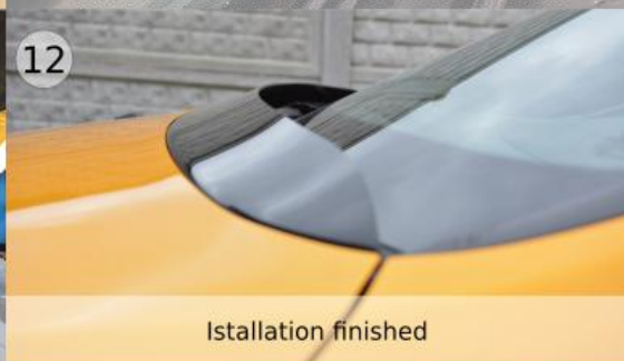
12 Installation finished